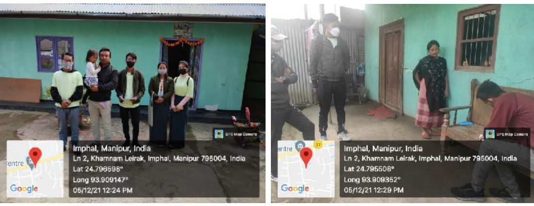
Survey team F