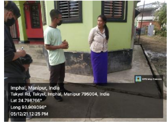
Team \, C \hspace{1cm} Team \, E

Survey team at Khamnam Leirak (village) about Awareness of health hygiene and identification of final vaccinated persons in this village. The survey report clearly indicate that all the family member above 18 years are 100% vaccinated