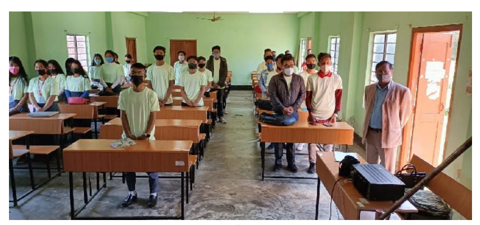
Inaugural Function of Special NSS 2021-22