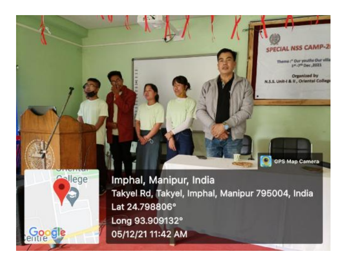
Closing morning programme with NSS song Survey at Khamnam Leirak