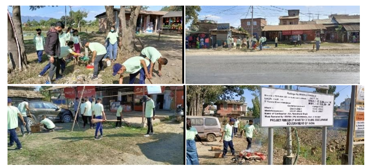
At khamnam Bazar , Imphal